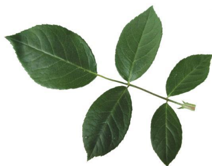
(a) A Leaf